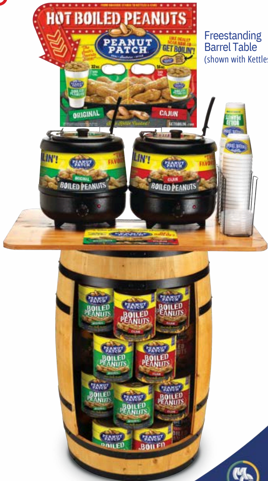
Freestanding Barrel Table (shown with Kettles)