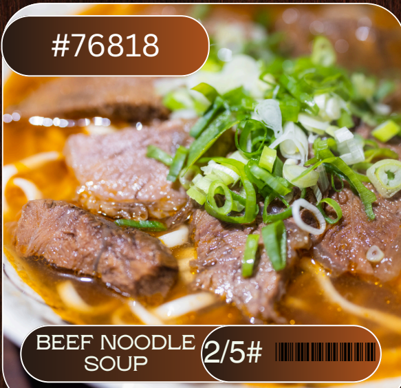
BEEF NOODLE SOUP