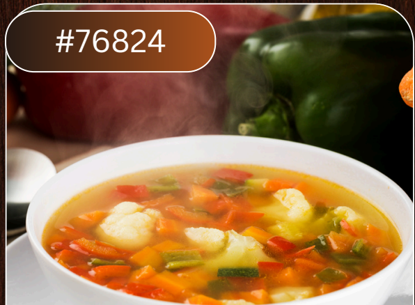
VEGETARIAN VEGETABLE SOUP