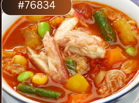
MARYLAND STYLE CRAB SOUP