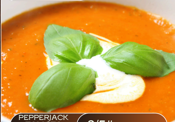
PEPPERJACK TOMATO SOUP