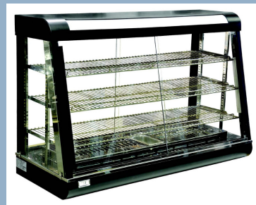
Hot Food Merchandisers