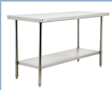
Steel Work Tables