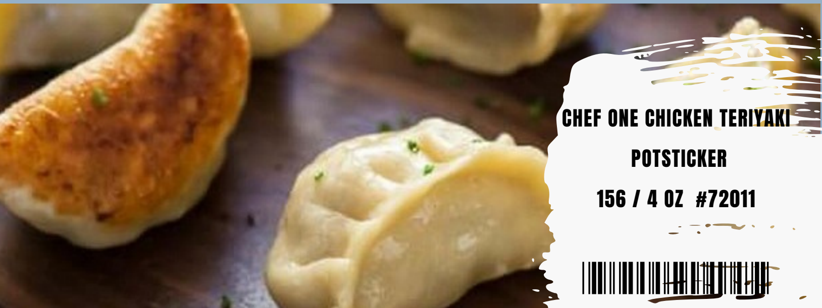
CHEF ONE CHICKEN TERIYAKI