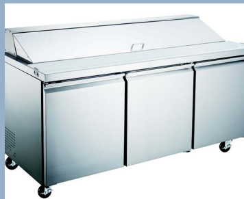
Refrigerated Prep Tables