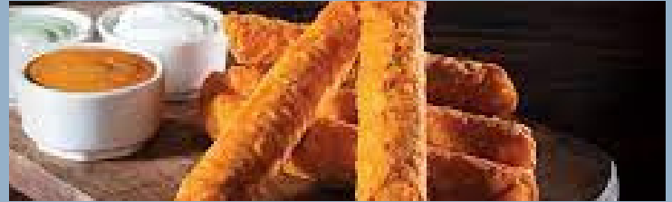
Nashville Chicken Rolled Tacos 72/2 oz #72565