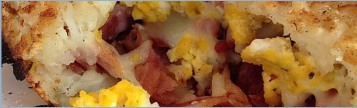
Hash Brown Stuffed Bacon, Egg & Cheese 4/3.75# #73195